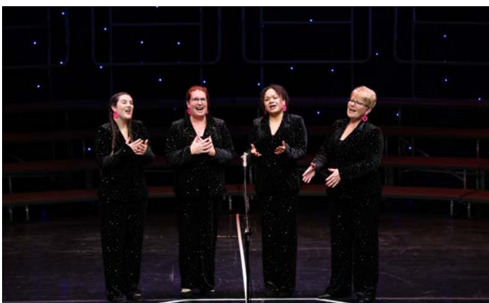
Rooftop Social Club: Women's Silver Medal Quartet and recipient of The Holland Harmony Trophy