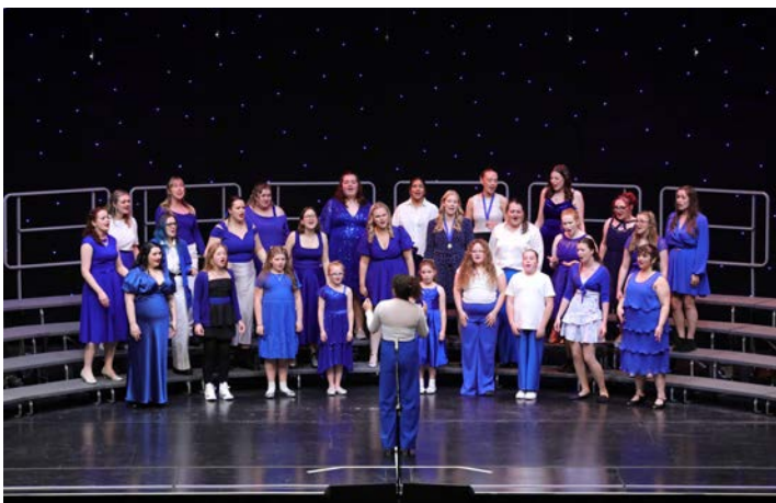
The LABBS Youth Chorus