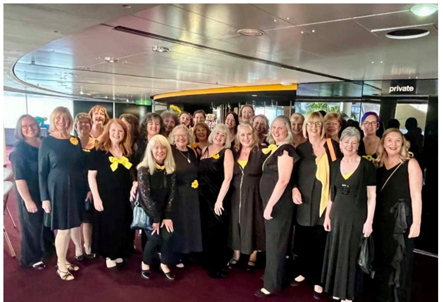
Sheffield Harmony at Harrogate Convention Centre after our performance