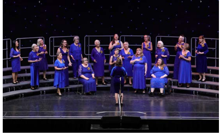
Avon Harmony: Recipients of The Millennium Award, The E&J Music Trophy, The Westering Trophy, and The Liverpool Trophy