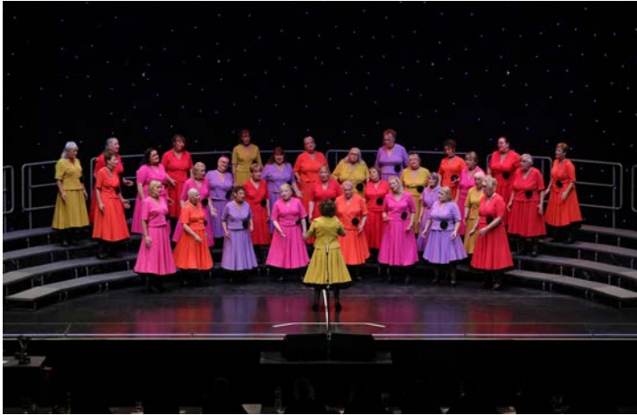
GEM Connection: 2nd Division - 2nd place