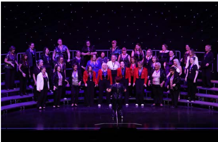
LABBS Women's Quartet Champions Chorus