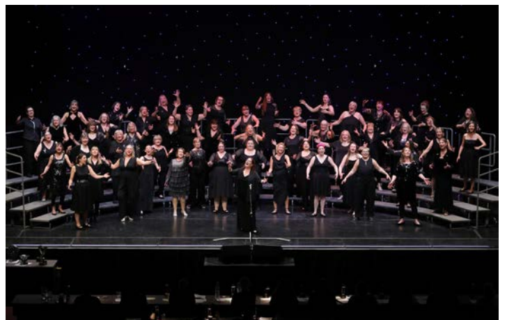
The White Rosettes