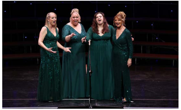
Fifth & Madison: Women's Bronze Medal Quartet and recipient of The Guildford Harmony Trophy