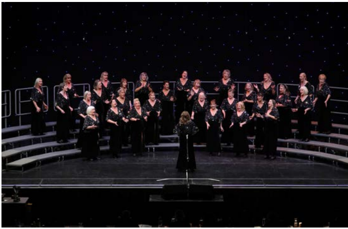
Cheshire A Cappella: 3rd Division - 2nd place