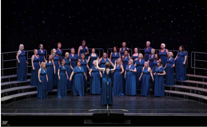
Abbey Belles: 3rd Division - 3rd place