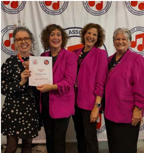
Receiving our second place certificate