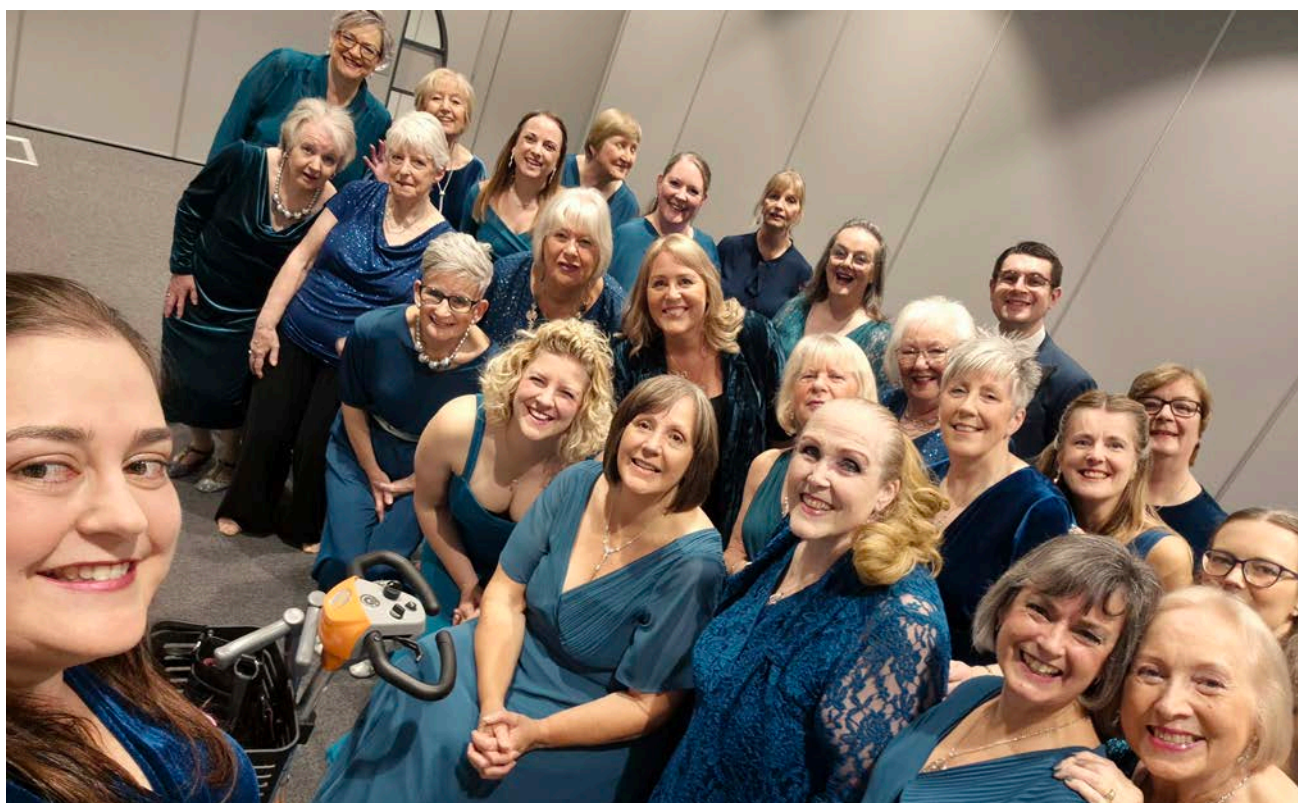
Main Street Sound