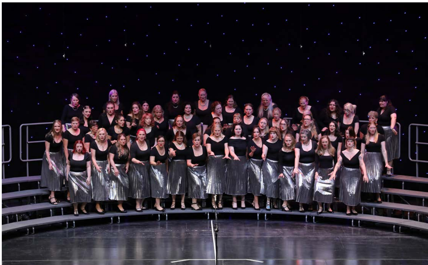
Steel City Voices: Gold Medal Chorus and recipient of The Brighton Rose Bowl