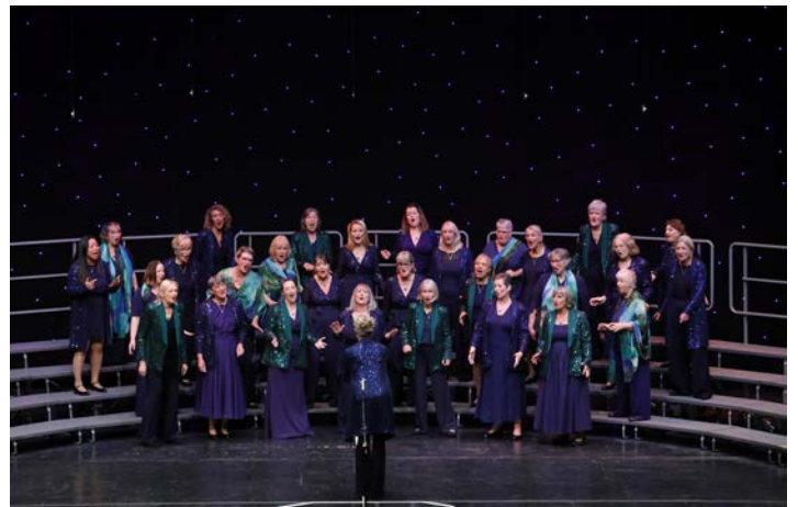
Mayflower A Cappella