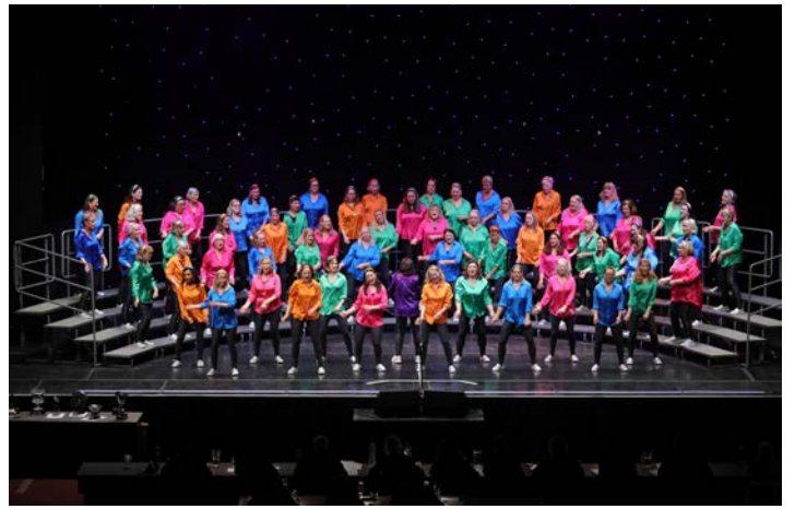
Amersham A Cappella