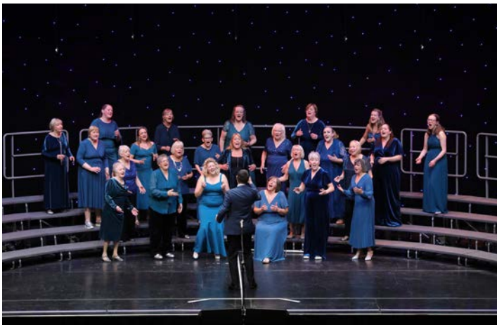
Main Street Sound: Recipient of The Red Rosettes Award (3rd Division winner)