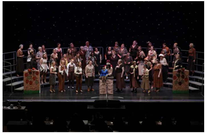
Crystal Chords: Recipient of The Harmony InSpires Trophy