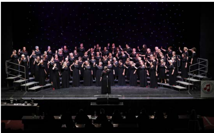
The Red Rosettes: Silver Medal Chorus and recipient of The White Rosettes Trophy and The BABS Entertainment Trophy