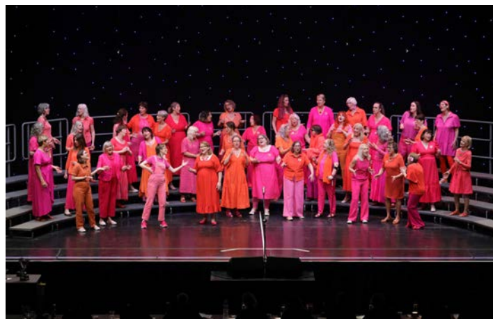
Norwich Harmony: 2nd Division - 3rd place; Most improved chorus, overall - 2nd place; Most improved marks in Musicality - 3rd place; Most improved marks in Performance - 3rd place; Most improved marks in Singing - 3rd place