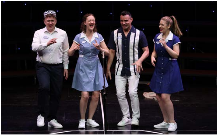
From the Top: Mixed Bronze Medal Quartet and recipient of The LABBS Mixed Bronze Medallist Quartet Trophy