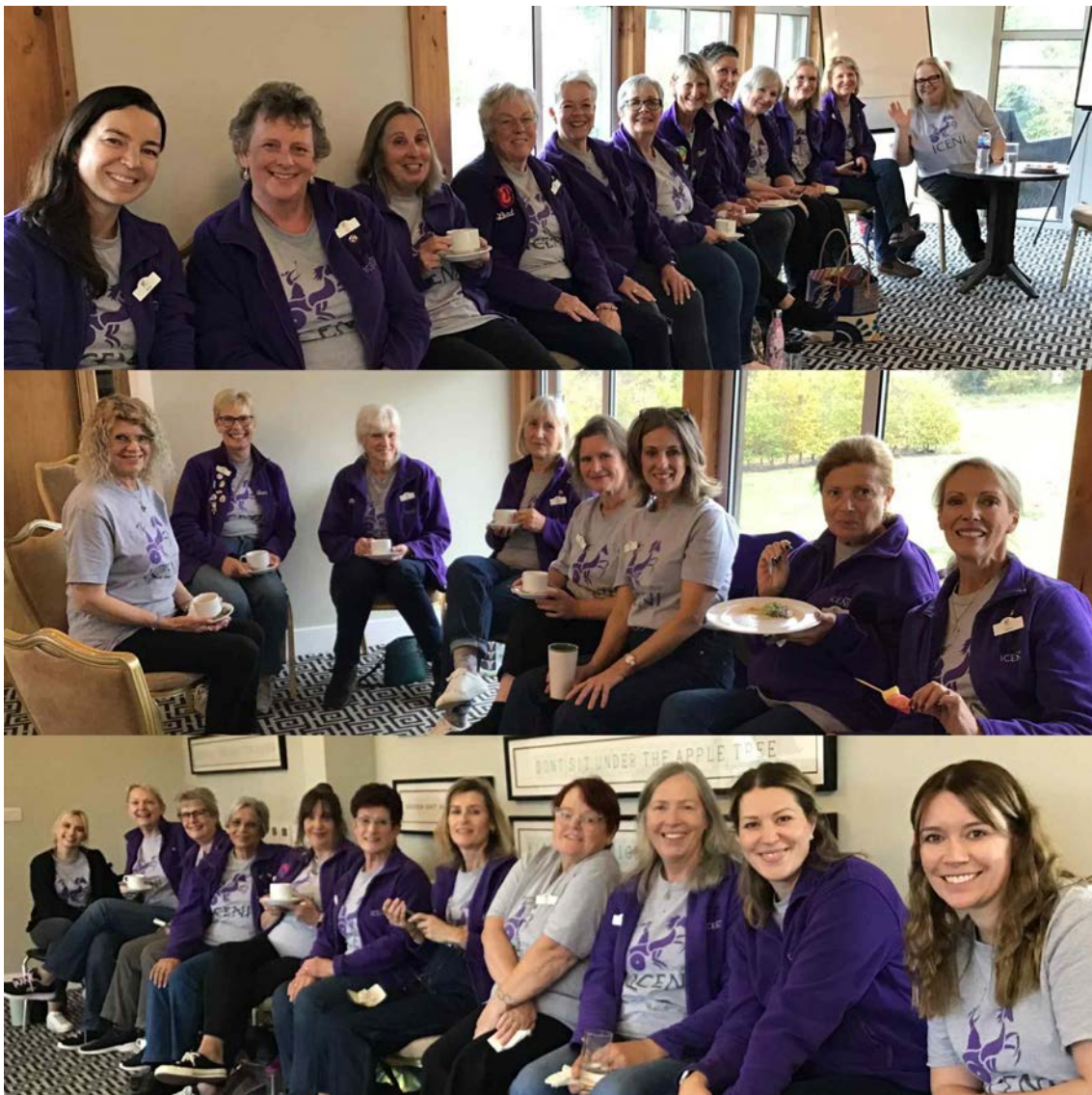
Chorus Iceni at retreat