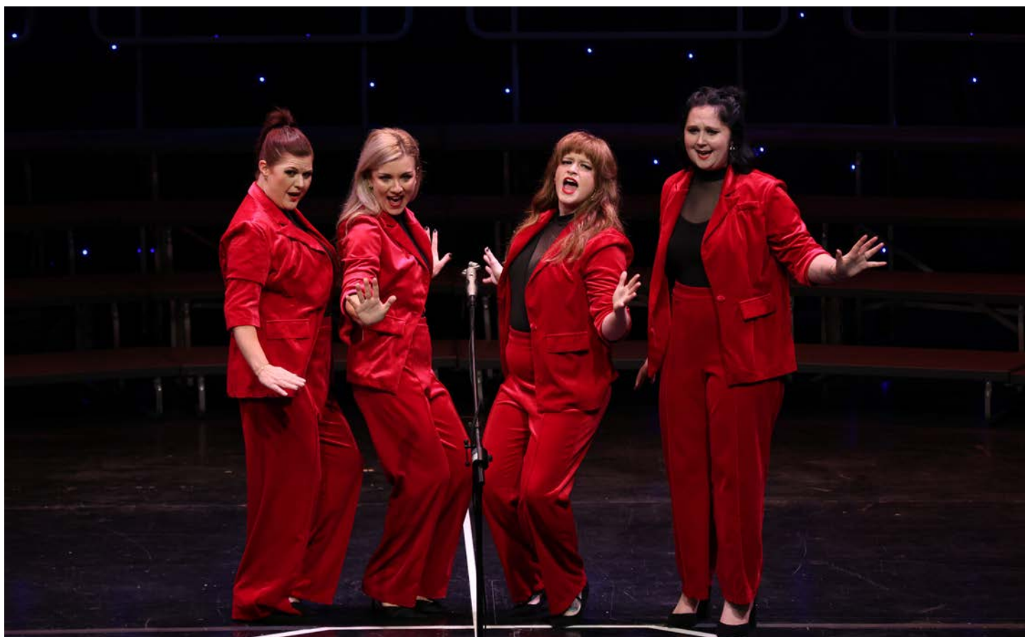
HOT MESS: Women's Gold Medal Quartet and recipient of The LABBS Champion Quartet Trophy