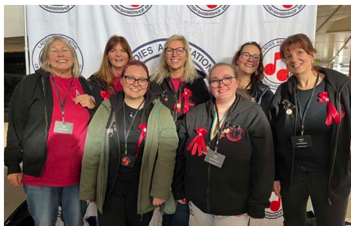
Even more newbies