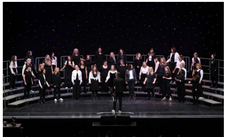
London City Singers: Bronze Medal Chorus and recipient of The Harmony Incorporated Trophy