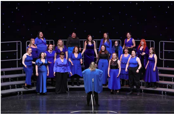
The LABBS Youth Chorus: Recipient of The Phoenix Trophy (Small Chorus winner)