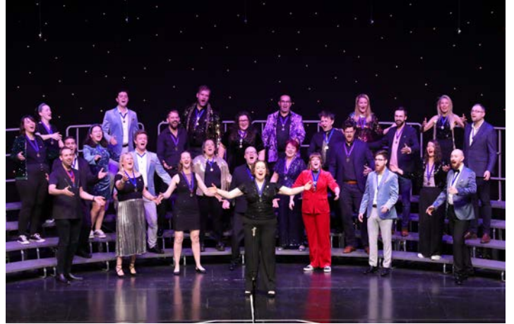
LABBS Mixed Quartet Champions Chorus