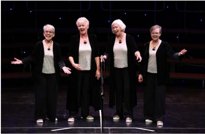
A Pitch in Time