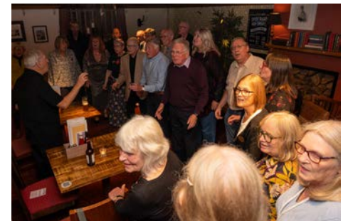
Junction 14 and MK Acapella

annual event. This year the charity was the Medical Detection Dogs and a fantastic sum of £972.87 was raised during the evening. We sang three new songs which were a great hit with the audience and our last song, and indeed the last song of the night, was Sweet Caroline, after which we received the best and loudest applause we have ever had. It was truly amazing.