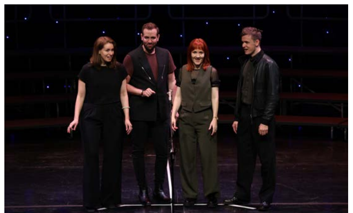
Flat Mates: Mixed Silver Medal Quartet and recipient of The LABBS Mixed Silver Medallist Quartet Trophy