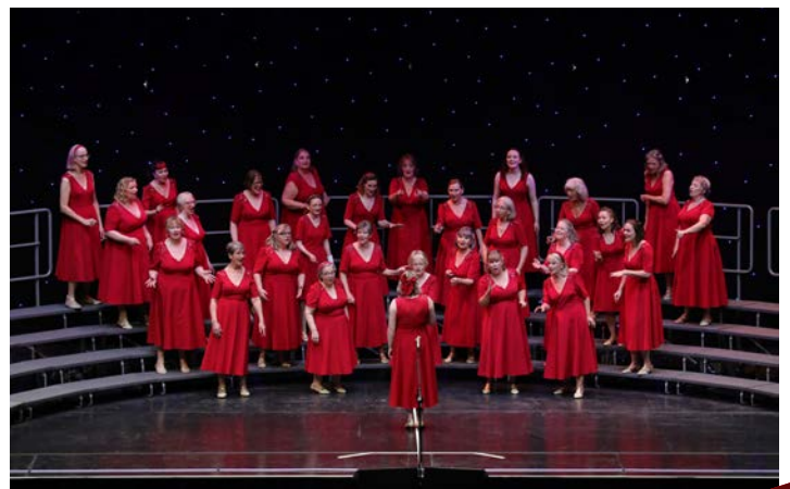
The Belles of Three Spires