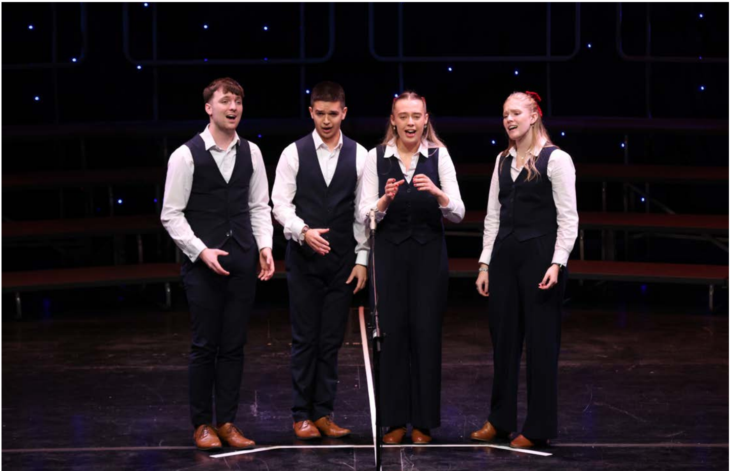
Ami Quartet: Mixed Gold Medal Quartet and recipient of The Hannah and the Hurricanes Champion Mixed Quartet Trophy, The Indigo Blue Trophy, The Pzazz Trophy and The Crackerjack Trophy