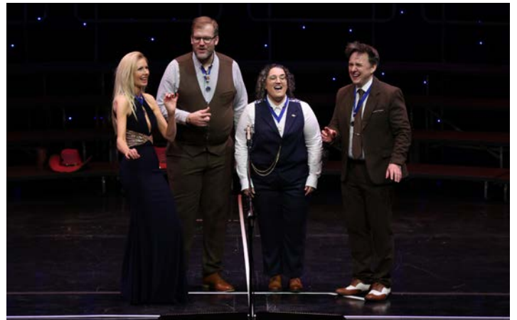
The Light Fantastic Quartet