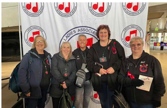
Red Rosettes newbies