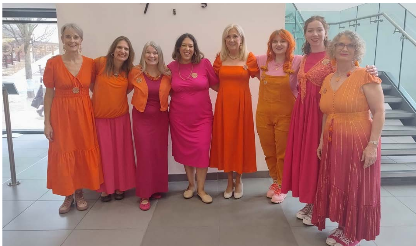
Norwich Harmony newbies