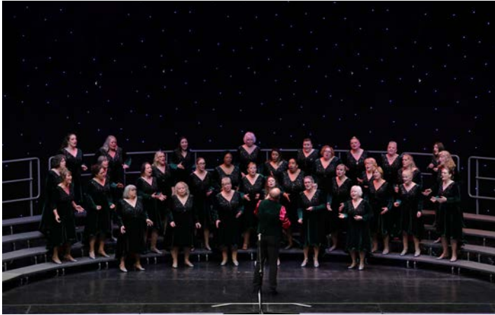
Second City Sound