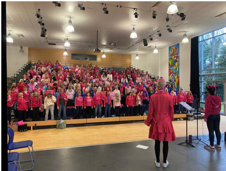
Barbie-themed Sing with Amersham Day 2025

Our 2026 Sing with Amersham day will run from 11am to 5pm when we'll learn an iconic 007 masterpiece. Tracks and score will be provided in advance. Bond outfits will definitely improve your singing. As will the plentiful cake. Please register here .